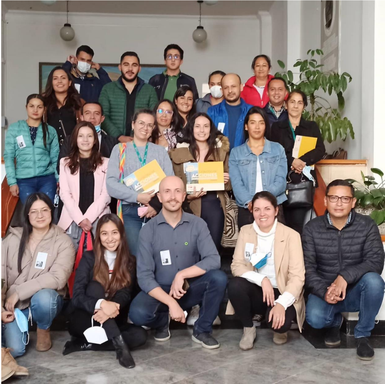
Figure 2. Socialization of the Catalogue of Decarbonization Actions in Energy and Transport with Boyacá's Secretariats