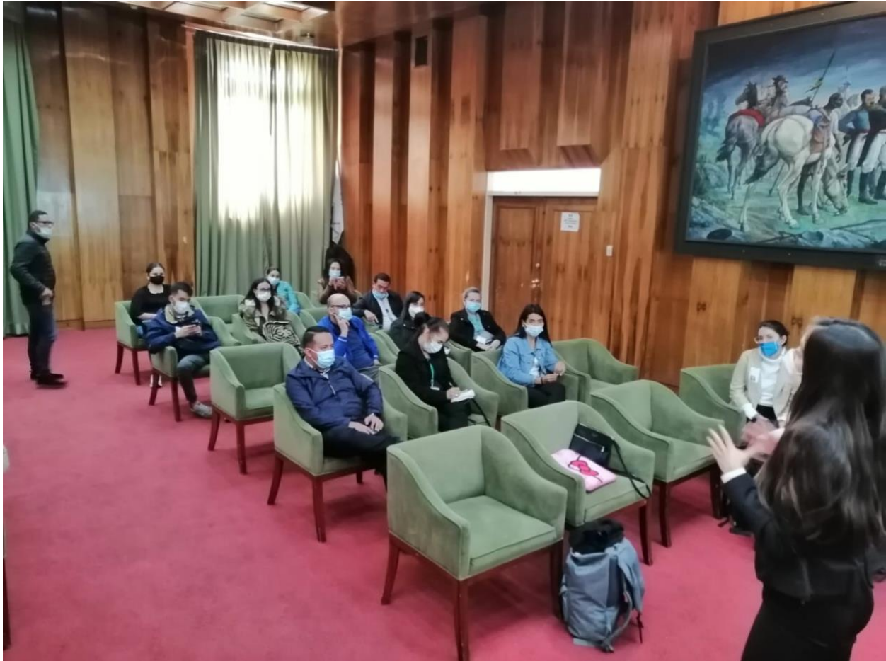
Figure 1. Pathways and decarbonization vision cocreation with Boyacá's Secretariats